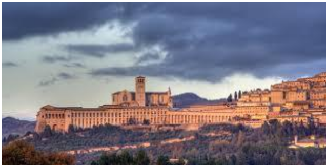
Assisi, central Italy