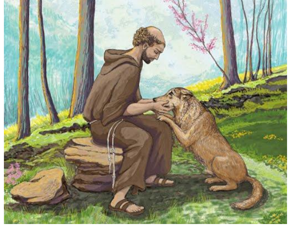
Saint Francis and the wolf

He died on the eve of 4 October, which became his patron saint's day. Assisi is a town in central Italy, north of Rome, only two hours from Florence where in 1931, 705 years after Francis' death, World Animal Day was officially adopted.